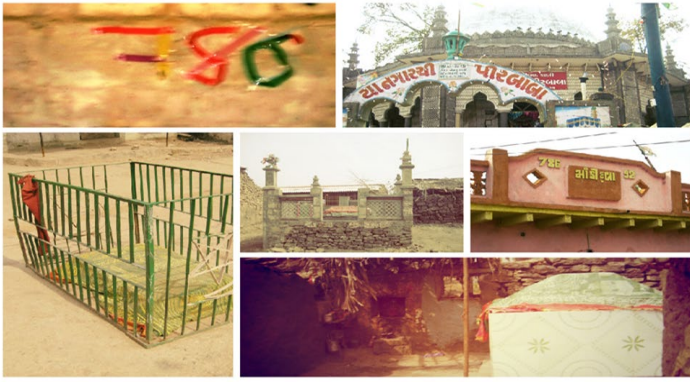
(Plate No:1 Above pictures depicts that in Madhupur Jambur village, Gir-Somnath, there are a number of dargahs of different pirs of which four are very important for them, namely Nagarshipirdargha, Baba Gor Ki dargha, Dasalbakukidargha and Mai-Parsa Ki dargha at Jambur village of Junagadh district.)

A clan is an Important unit for Siddhis of Gujarat, social organisation which is an exogamous as well as patriarchal and is locally called Shakh or Atak. One of the important functions of a clan is the regulation of marriage and as after marriage girls are accepted into the clans of their respective husbands. A good number of clans were identified among the Siddhis of Gujarat like Mosgul, Mokwana, Chotiyara, Mori, Sirwan, Parmar, Morima, Makava, etc. There is no ranking of clans as such, rather all have equal status. Siddhi of Gujarat seems to have taken few Gujarati titles such as Parmar or Makava which the local Gujaratis bear as their surnames. Hence they may not be original to their ancestral clan division rather made in due course of time while they assimilated into the local culture as rulers.