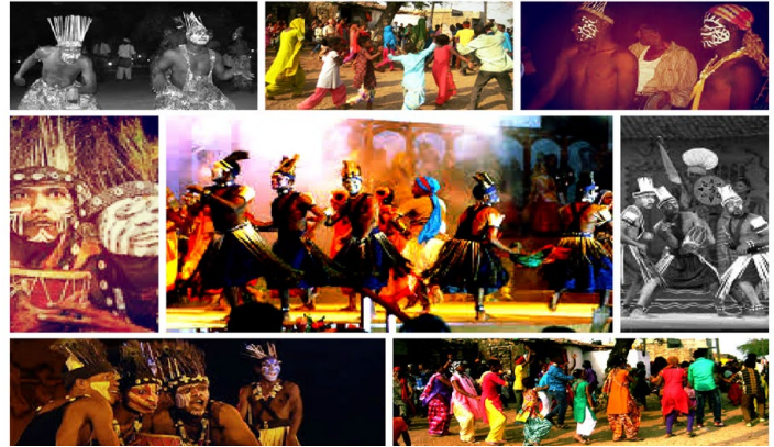
(Plate No:2 Picture depicts Dhamal dance and music performed by Siddhis. Siddhis are well versed in tribal dance and music. Their unique way of dancing and music leave spellbinding effects on audiences).

one or the other Pir. Siddhis of Gujarat have been following Eid, Ramjan and Moharram. Some of the Siddhi offer Namaj every day. They also believe in supernatural powers: They have Bhua (a spirit possessed man) who has the power to cure various ailments of the people.